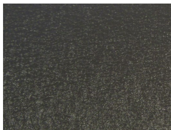
MUSKET GRAY 3D