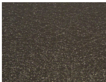
BURNISHED SLATE 3D