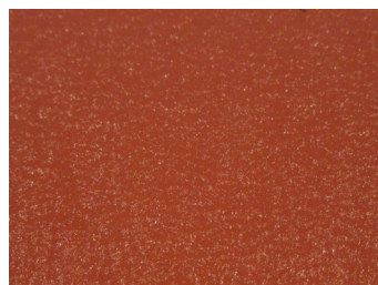
TERRA COTTA 3D