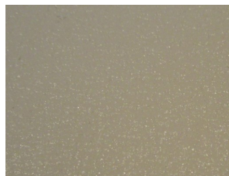
SIERRA TAN 3D