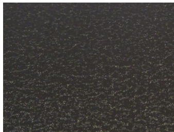
DARK BRONZE 3D