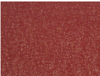
COLONIAL RED 3D