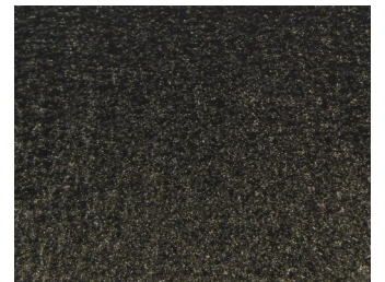
MATTE BLACK 3D