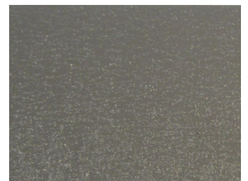
SLATE GRAY 3D