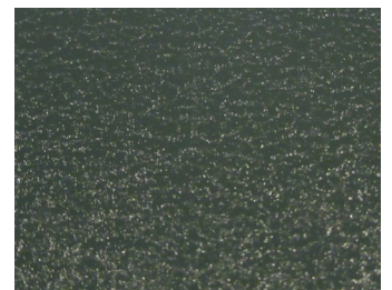
CLASSIC GREEN 3D