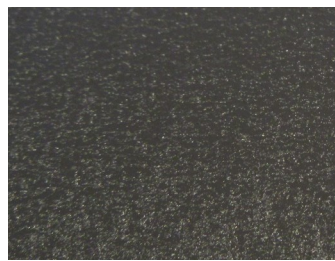
CHARCOAL GRAY 3D